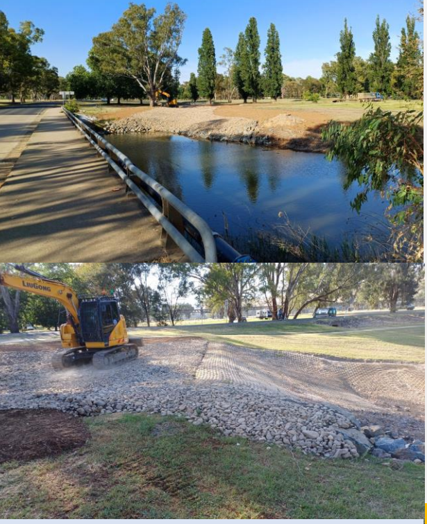
Above: Sherwood Forest works are progressing; the masterplan will deliver a space for all to enjoy.