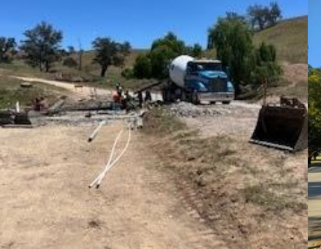
Above & below: The new Bundarbo causeway has been completed, replacing the causeway damaged in flood.

Above: Council teams have installed a new footpath in Bourke Street Cootamundra, bird netting to the grandstand in Fisher Park and had Bassingthwaite Oval (inset) looking a picture for the 700 students who took part in the Catholic Schools touch football carnival.